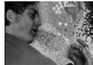
SMOKING IS DANGEROUS TO YOUR HEALTH