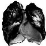
SMOKING DAMAGES YOUR LUNGS