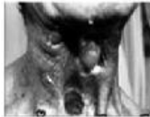
SMOKING CAUSES THROAT CANCER