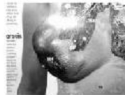
SMOKING CAUSES BREAST CANCER