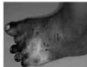
TOBACCO SMOKING CAUSES DISEASES