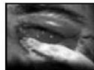
SMOKING CAUSES CATARACTS AND BLINDNESS