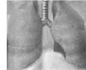
KEEP YOUR LUNGS HEALTHY STOP SMOKING