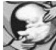
SMOKING IS DANGEROUS TO THE UNBORN BABY