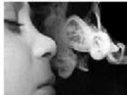
SMOKING IS DANGEROUS TO YOU AND NON- SMOKERS