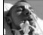
TOBACCO SMOKING KILLS